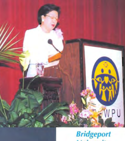
Bridgeport University, April 2.