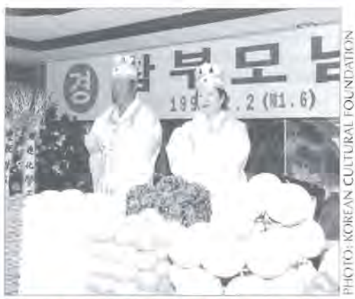
True Parents' Birthday pledge service in Korea.