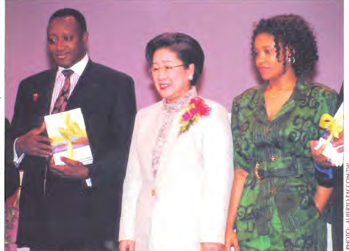
Mother with VIP guests following her speech at the Manhattan Center on April 9, 1998.

true freedom. True freedom is self-sustaining.