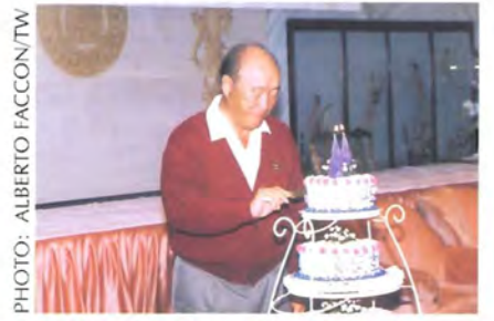
Father cuts the celebration cake after Mother finishes her speech in Richmond.

Manhattan Center's Hammerstein Ballroom.