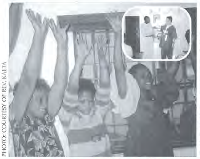
Togo's first public Hoon Dok Hae; March 1, 1998.

As Father himself explained in the CONTINUED ON PAGE 27