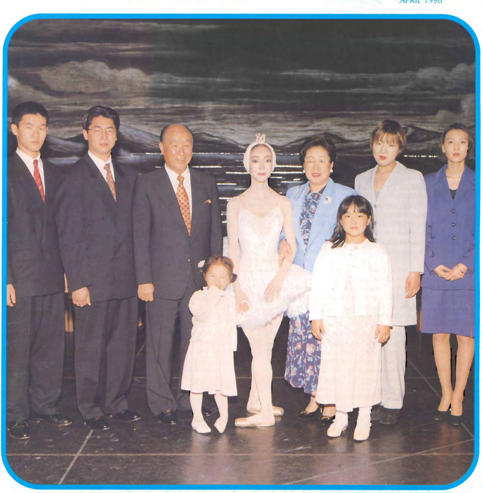
Father—"True Parents" Mother—"Blessed Marriage and Eternal Life"