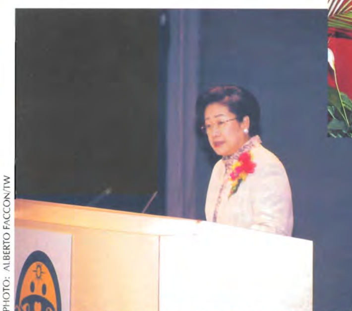
Mother speaks at the Manhattan Center's Hammerstein Ballroom in New York City on April 9.

Manhattan Center's Hammerstein Ballroom.