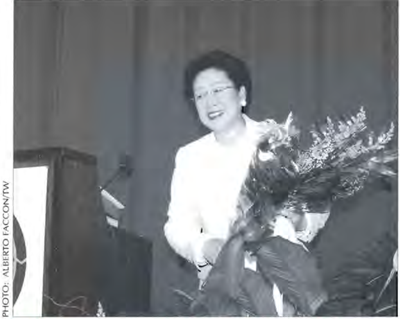
Mother receives congratulatory flowers after her speech at Bridgeport University on April 2, 1998.