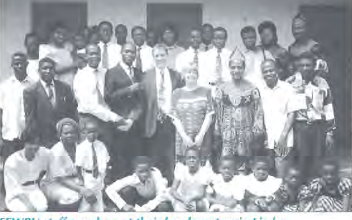
sons. We ask peo-Cameroon in June 1997.

which provided the substance we were looking for. Each organization by itself is perhaps not enough, but together the picture is wonderful and powerful. IRFF is the best organization to center the other projects around, as its mission does not force anyone to look at themselves. We explain how IRFF is working with WFWP, IRF, YFWP, FWP, WIDP, SCWP and FFWPU in order to build a stronger nation. IRFF can take credit for bringing the good