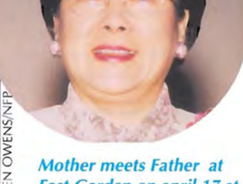
Mother meets Father at East Garden on april 17 at the end of the tour.