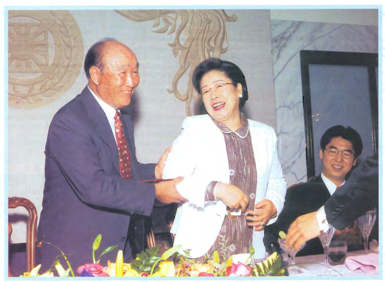
FATHER INVITES MOTHER TO SING AT A BANQUET HELD AT EAST GARDEN FOR THE UNIVERSAL BALLET TO CELEBRATE THE COMPANY'S FIRST U.S. TOUR.

"God has taught us to forget the good that we do for others. This creates a spontaneous and natural circular motion of give and take in our daily lives. It is similar to the natural phenomenon we observe in the atmosphere. This constant cycle of give and take leads to eternal life."