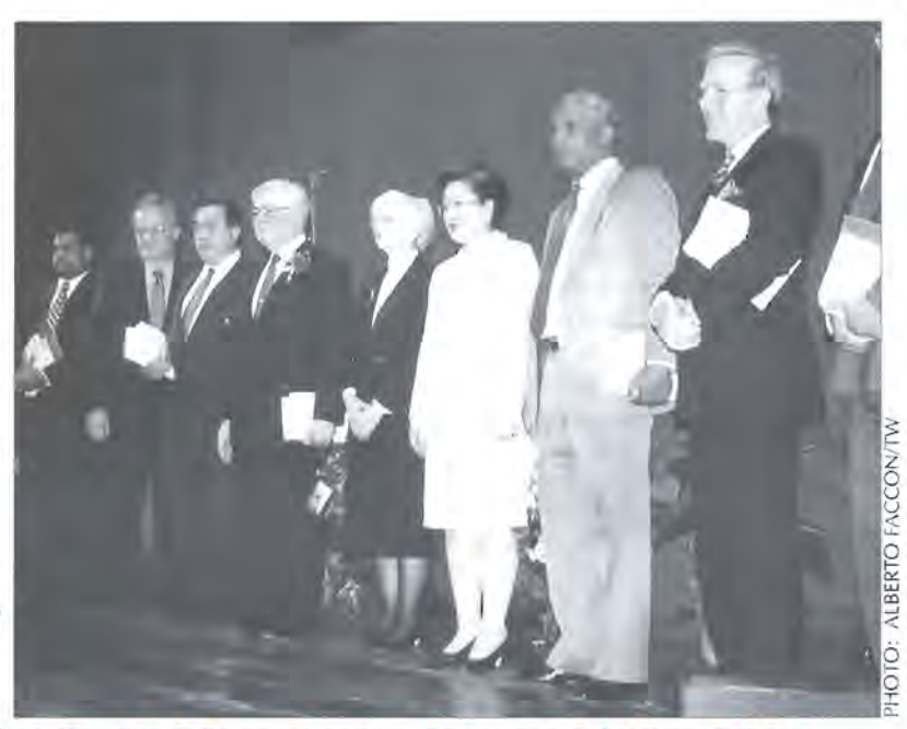
publications following her speech at Bridgeport University on April 2.

How often have you been confused by the changes taking