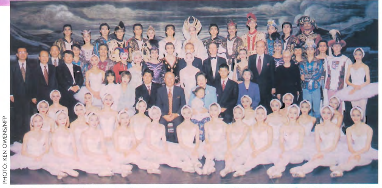
TRUE PARENTS, TRUE CHILDREN AND CHURCH LEADERS POSE WITH THE UNIVERSAL BALLET COMPANY FOLLOWING ITS FINAL PERFORMANCE OF SWAN LAKE.