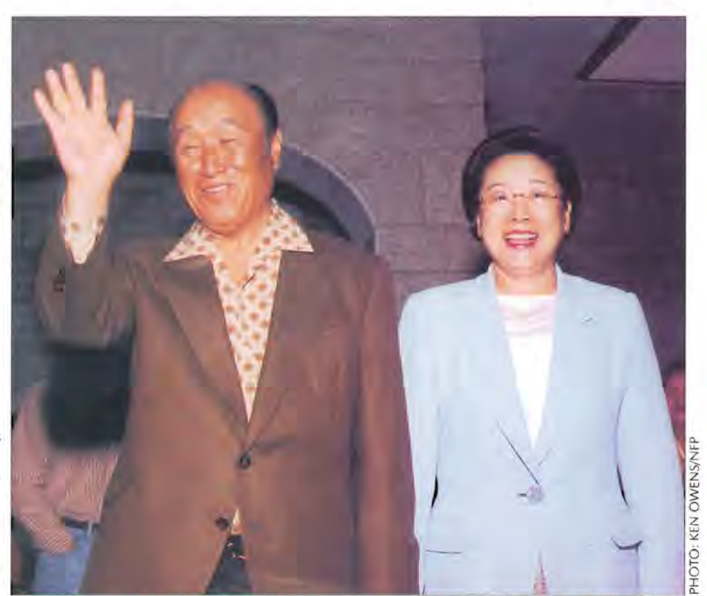
True Parents are happily re-united at East Garden after the completion of the North American Hoon Dok Hae tour.

[To be continued in the next Issue. Edited for Today's World]